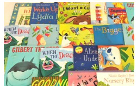
Reading for pleasure

Airedale Infants is operated by Northern Ambition Academies Trust, an exempt charity and a company limited by guarantee. Registered in England and Wales, No: 07556117 Registered Office: Airedale Academy, Crewe Road, Castleford, West Yorkshire, WF10 3JU Tel: 01977 664555.