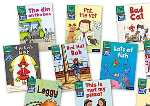
Book Bag Books