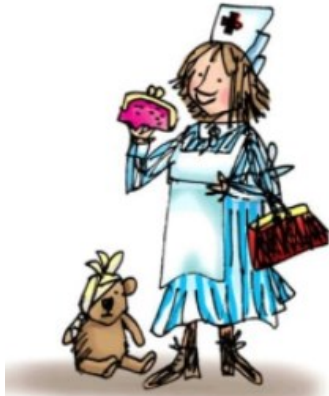
nurse with a purse